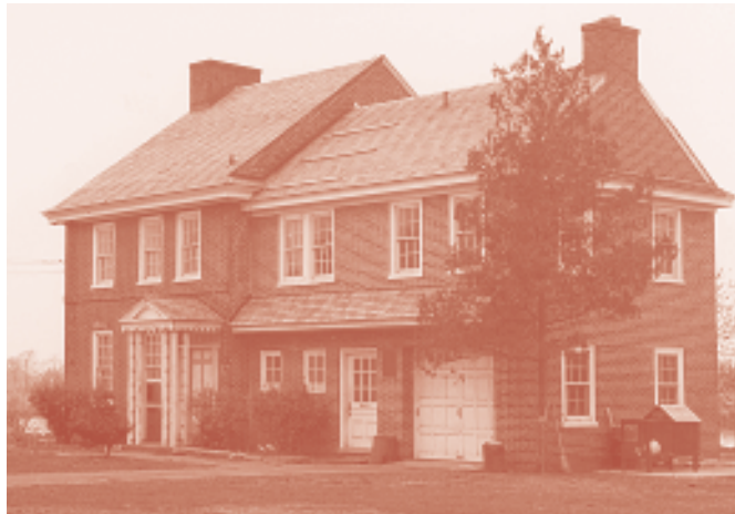
Pictured the east wing as constructed by WPA in 1939.